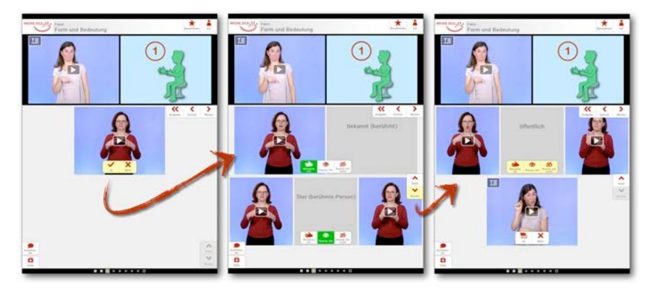
Figure 6: Example page of a work package "Form and Meaning"20.

Work packages are organised in pages and rows. Task explanations and questions are all presented in DGS and written German (a button allows to switch between both languages), other content is provided as film, text or pictures depending on the purpose.